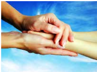
Access To Allied Psychological Services