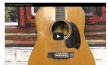
Depression and Anxiety