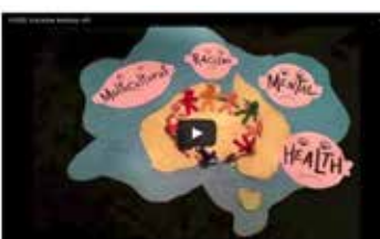
We have the power to change

To view the videos and Voicebox project visit: