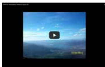
Asperges: A message for newly diagnosed or those who don't know how to speak Aspe