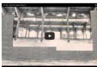
The importance of consulting with consumers