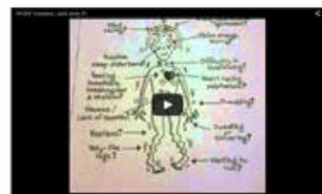
Recovery and Wellness - What works for me & What other need